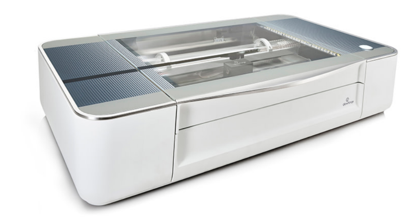
Fig. 1. Glowforge Laser Cutter

Students used Solidworks modeling and rapid prototyping techniques to design and fabricate selected products from a range of commonly used materials (i.e. – wood, acrylic, PDMS). The two most common machines used in ENGR 328 were a Glowforge laser cutter (Fig. 1) and a range of 3D printers (Fig. 2).