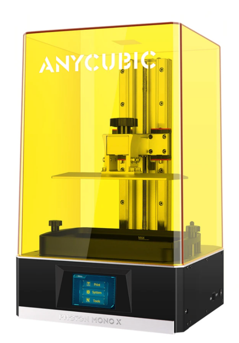
Fig. 2. MSLA 3D Printer