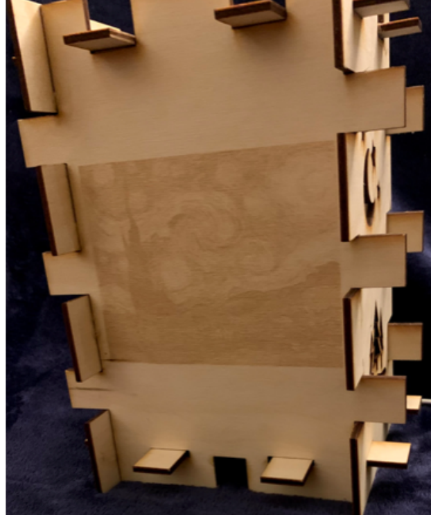
Fig. 3. Final Products for Laser-cut Lamp Project